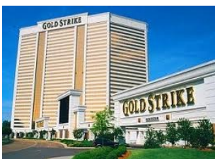
Gold Strike Resort Robinsonville, MS