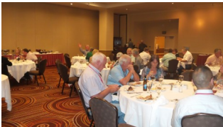
Friday Night Banquet