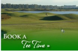
River Bend Links Golf Outing